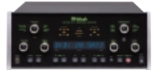
MX132 A/V CONTROL CENTER + PROCESSOR