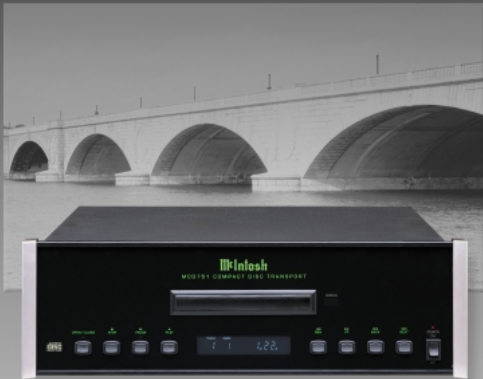
MCD751 CD Transport